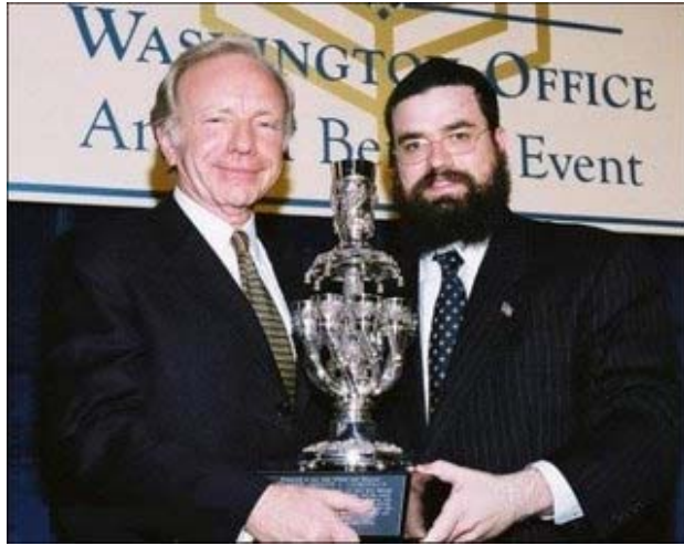
Senator Joseph Lieberman